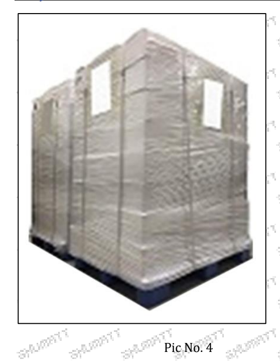
Pic No. 4

Pallet Shipping: Use pallet that meet export requirements, and use white wrapping protective film to wrap and bind with cable ties