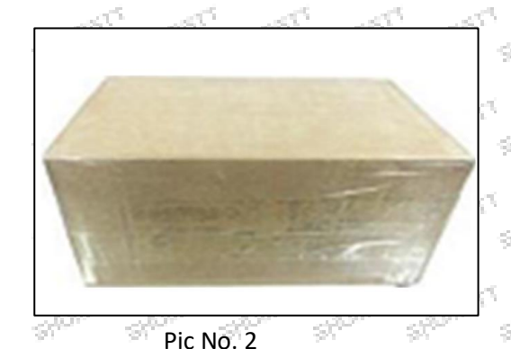
Domestic express packaging:

Minors are prohibited from using transparent tape, yellow tape, black wrapping protective film, and white wrapping protective film to avoid personal injury.