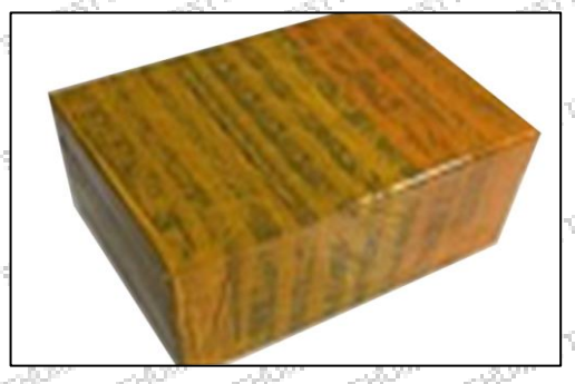
Pic No. 3